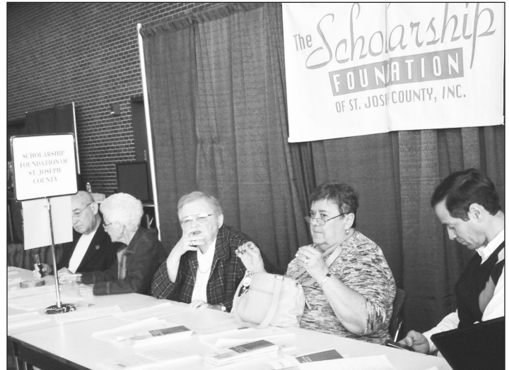
The Scholarship Foundation's table offers information on its scholarship grants and the location of college tables.